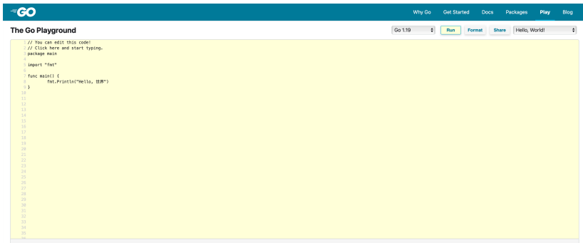
Figure 2: https://go.dev/play/